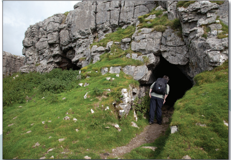
Entrance to Jubilee Cave