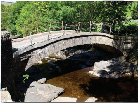
Packhorse bridge over the River Dee