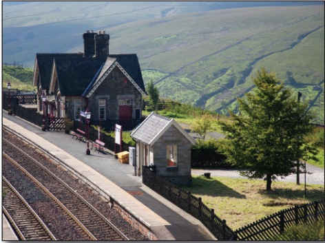
Dent Railway Station